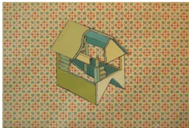
Kay Knight, Tool House, Gouache on vintage wallpaper, 18" x 23", 2008

Dream Homes; Portraits of Disbelief is an exhibition of paintings and drawings by Milwaukee based artist Kay Knight. The works are based on 1950's schematic drawings of house-like structures. Knight appropriates illustrations of middle class homes and incorporates vintage wallpaper. The work reflects on the contradictory and vulnerable times we live in.